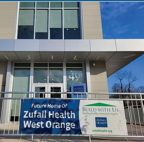
Exterior of 49 Mount Pleasant Avenue.